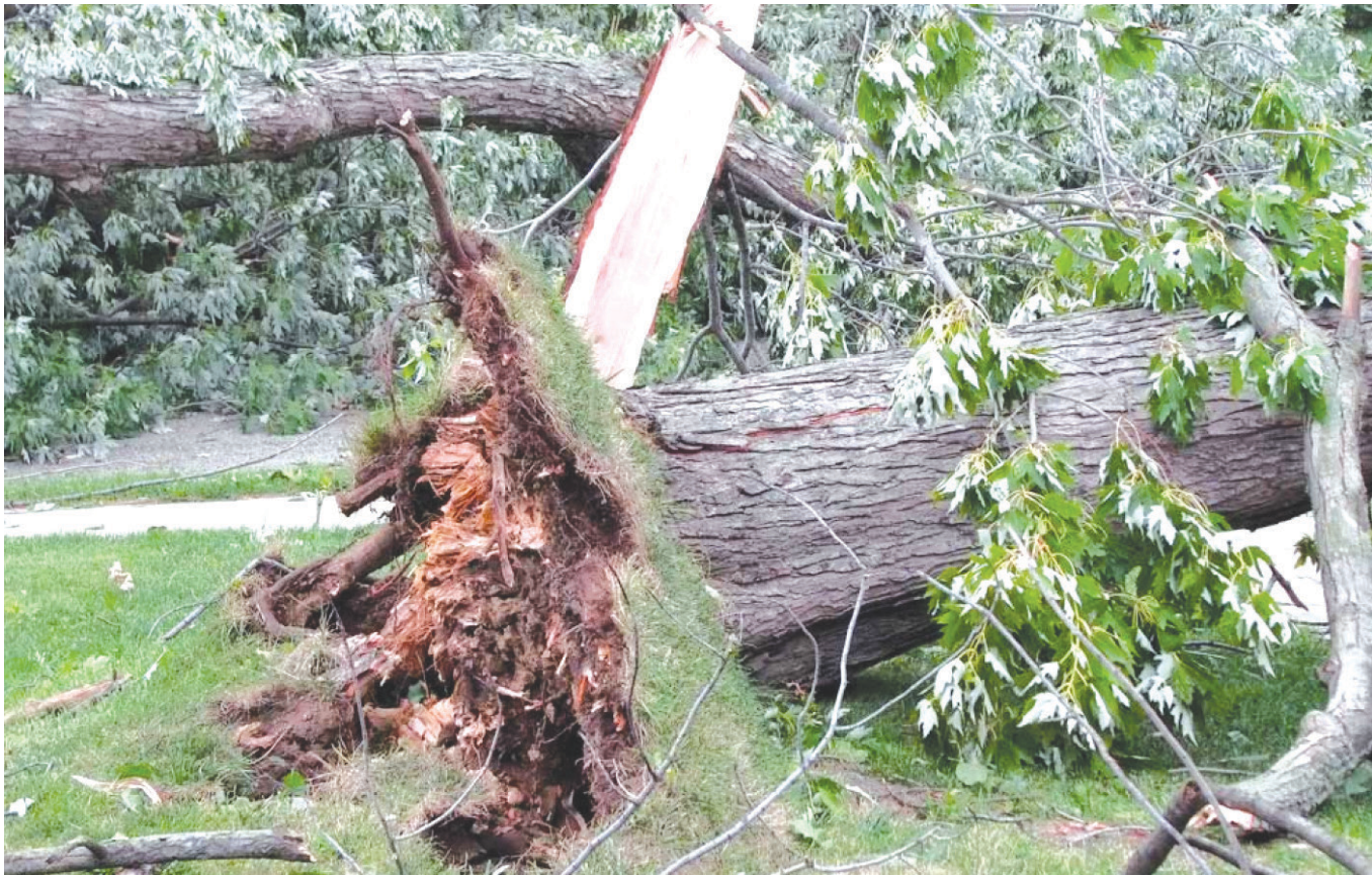
A downed tree on Osage Street in Grove during a storm that produced three tornados which touched down at the end of April.

July 15: Delco Commissioners issue a Disaster Emergency Proclamation declaring the flooding which took place overnight on July 18 as a public emergency. The rain