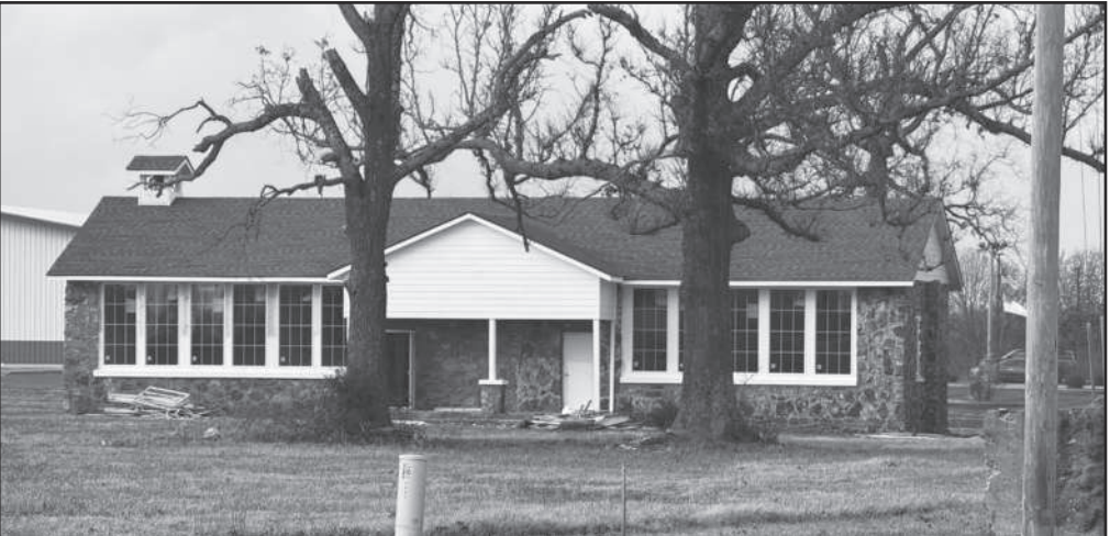
The renovations of the National Register Delaware County School rural schoolhouse continue with new windows being installed. It was built in 1930, with local limestone and volunteer help, and the last classes were held in the spring of 1963. The Delaware County-owned building known as the Delaware School, District No. 64 is located six miles north of Jay on U.S Highway 59 and was added to the National Register of Historic Sites in 2024.

technology services back in house if they desire to protect sensitive data. As you can see, I’ve tried to lower taxes for consumers and businesses, and I’ve attempted to lessen unnecessary regulations in an effort to streamline government. I’ll keep working on these and other issues in our 2026 legislative session, which starts Feb. 2. Remember, I’m here if you need me: (405) 557-7399 or steve.bashore@okhouse.gov .