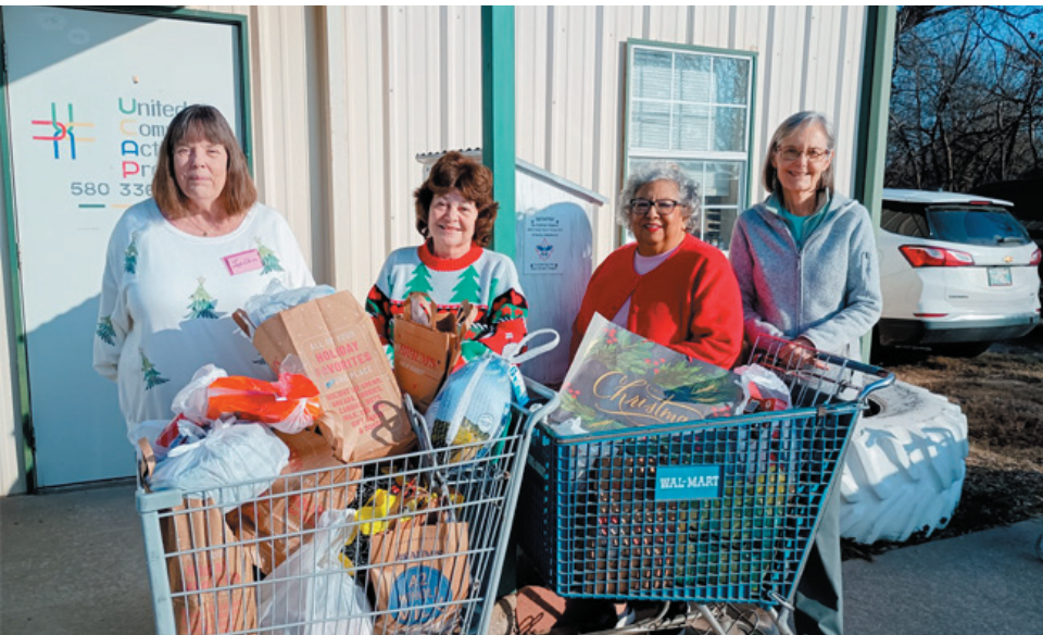
St. Rose of Lima Catholic Church ladies group donation.

Volunteers worked diligently to organize and sort the new items, assist shoppers, and ensure everyone felt respected and cared for. Smiles, gratitude, and holiday spirit filled the space as families selected gifts for their loved ones. This event provided a meaningful reminder of the power of community support and generosity during the Christmas season. The solid feeling of the supportive environment brought in the St. Rose of Lima Catholic Church ladies group to donate; they dropped off food to pack up for one lucky family.