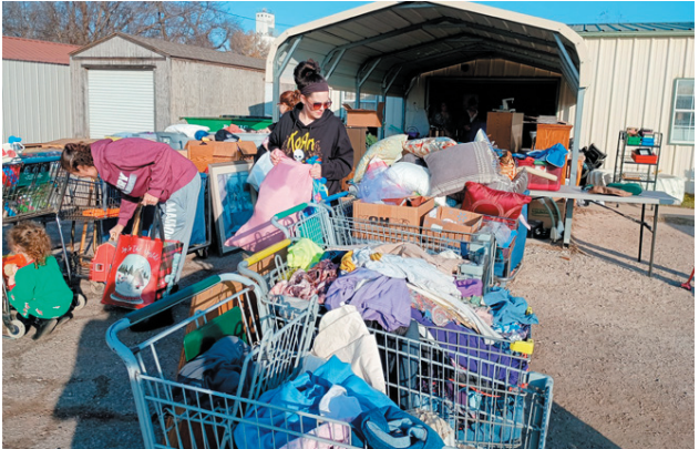
Trailers and carts were left out for shoppers to look through.

This is what makes Perry truly special. This new reporter witnessed the compassion and generosity shared between customers and volunteers, making it a memorable and inspiring first experience that truly captured the spirit of Christmas.