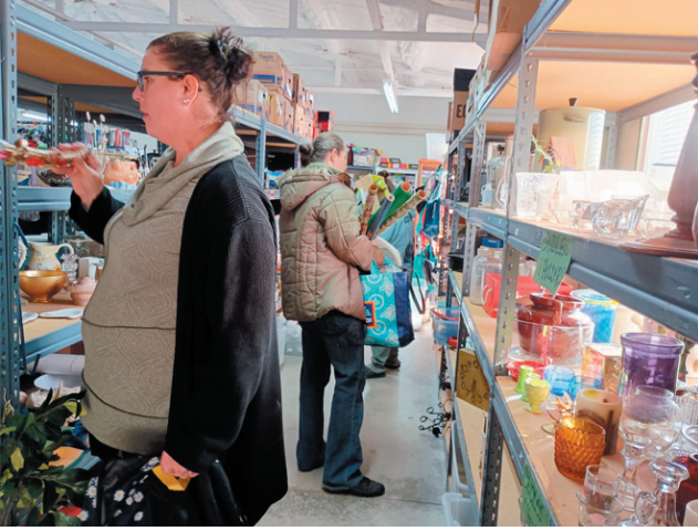
Shoppers perusing inside for gifts.