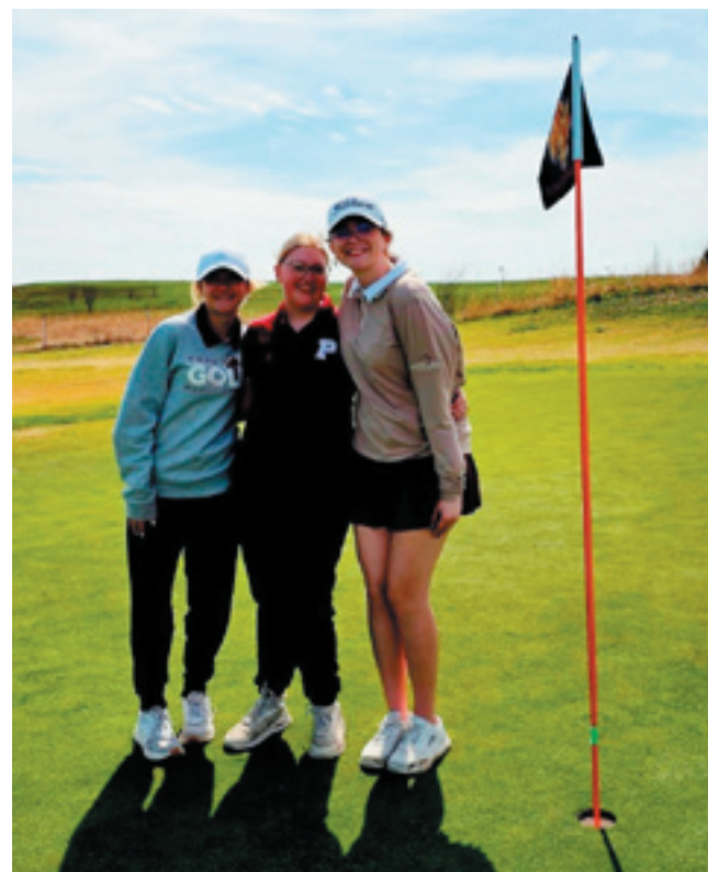
Perry High School girls golf team competed in the Pioneer Mustang Invitational.