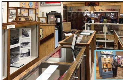
Interior view of the museums in Vinita (inset) and Needles, California.