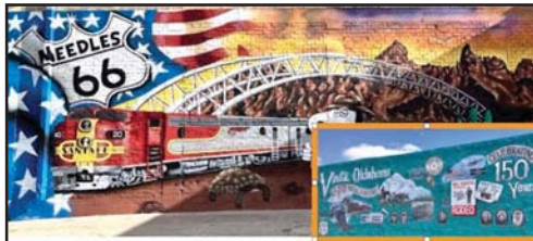
Murals in the downtowns of Vinita (inset) and Needles, California.