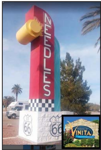
Welcome signs in Vinita (inset) and Needles, California.

Many other comparisons exist between these two Route 66 small towns. But just one more difference remains for today's balancing act: Needles average high temperature in July is 110 degrees. Average high temperature in July is 110 degrees. Average high temperature in July for Vinita is a mild (comparatively) 92.